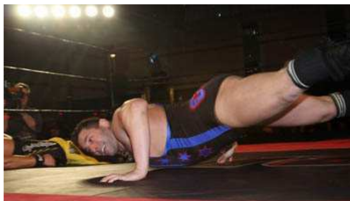
Colt Cabana tries to do The Worm during a January Ring of Honor show in Los Angeles.

"I think I got on the website because -- and this is just my opinion -- I think that the higher ups at WWE really didn't care about the website. The young guys on the creative team thought they could just sneak me in on the dot-com show, even though nobody really wanted to do anything with me on TV. I think the show got better every week. It had a strong following, my blogs on WWE.com were getting more hits than Matt Hardy's or Michelle McCool's . I think they would have continued to get better, but obviously, it got cut short (with his release)."