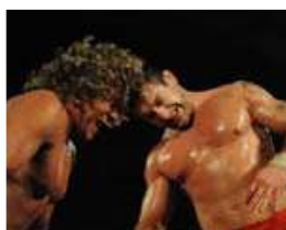
Ring of Honor Toronto