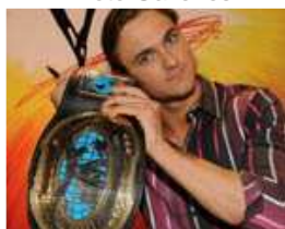
WWE Fan Axxess: Day 1