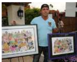
Wrestlemania Art Exhibition