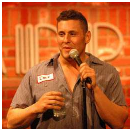
Colt Cabana performs comedy.

In addition to the numerous WWE events going on in Phoenix this weekend, a number of other wrestling-related alternatives are available for the fans. For those interested in some comic relief, Ring of Honor star Colt Cabana (known as Scotty Goldman during his recent WWE stint) and wrestling legend Mick Foley will be performing a stand-up comedy show at Arizona University's Gammage Auditorium on Saturday night, the night before WrestleMania.