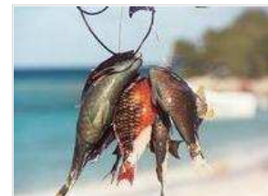
Antigua and Barbuda